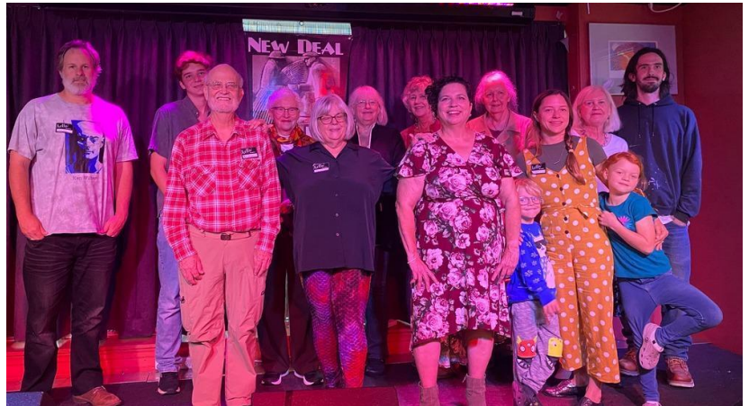
Ekphrastic Art Show photographs courtesy of Greenbelt Online ( https://www.greenbeltonline.org/ ).

$1,970 to the Friends of New Deal Café Arts to put on an “Ekphrastic Fantastic Art Show.” (Ekphrasis. Noun. “A literary description of or commentary on a visual work of art” — Merriam-Webster.) From the grant submission: “This show brought together two forms of art: visual art and poetry. It allowed poets to write a poem in response to a piece of visual art, and allowed visual artists to create a piece in response to a poem.” The resulting works were displayed at the New Deal Café, which hosted a reception for the show.