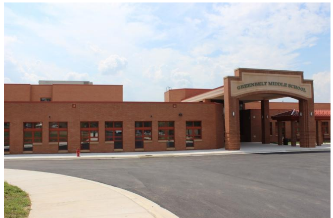
Greenbelt Middle School (Higher Achievement Academic Enrichment)